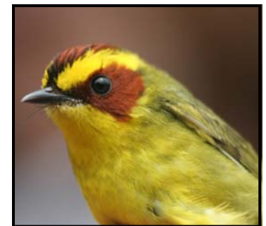
Golden-browed Warbler, Mexico